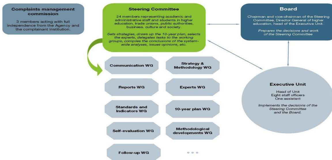
Agency organisational chart (SAR – page 11)